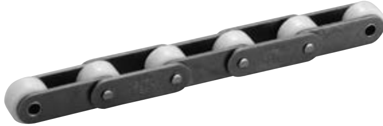
Resin Roller (DL)

DL type double pitch roller chain is another version of R type roller in which resin rollers are employed to reduce weight and travel noise. Nickel plated versions and stainless steel versions are also available. The DL type can be used with various attachments.